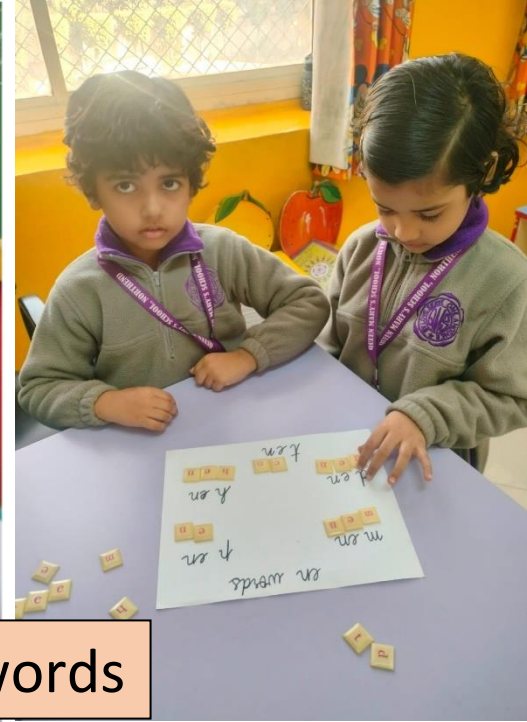
Formation of 'e' vowel words